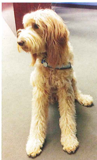
Bianca calms as she visits.